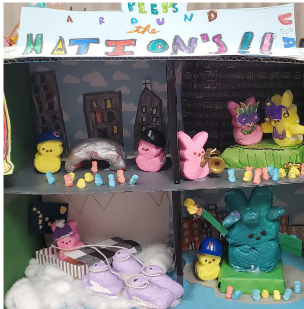
2023 People's Choice Winner: Peeps Around the Nations by Luke Weiland