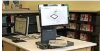
Self-checkout machine in the Children's Department