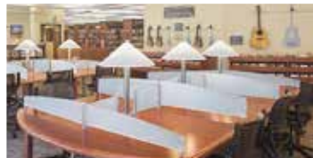
Connect Zone table