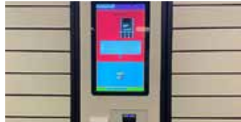
24-hour book pickup lockers

Throughout the years, the generosity of our donors has provided funding for many projects, including: