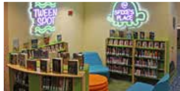
Signs and shelving for the Tween Spot