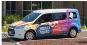
Library vehicle (in conjunction with the library)