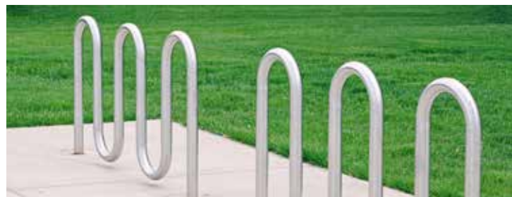
A new bike rack for the front of the library