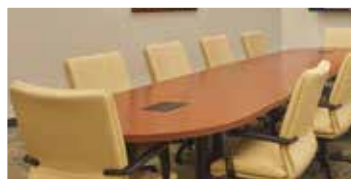
Conference Room furniture