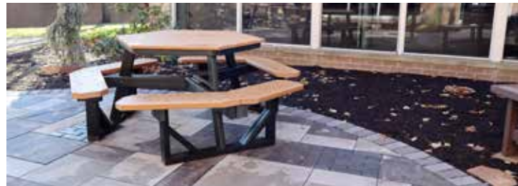
New picnic tables for the Pollinator Garden