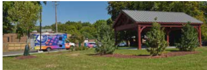
A sign at the library's Elm Road entrance

The Library Foundation is working to raise $15,000 for outdoor improvements, including: