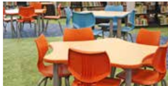
Children's Room furniture