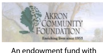
An endowment fund with the Akron Community Foundation