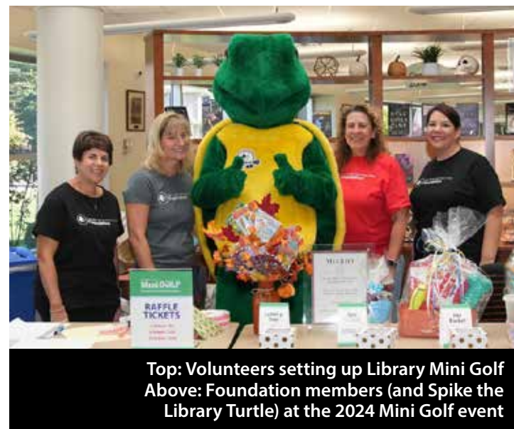
Top: Volunteers setting up Library Mini Golf Above: Foundation members (and Spike the Library Turtle) at the 2024 Mini Golf event