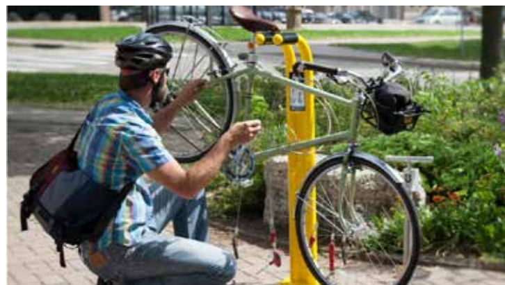
A bike repair station